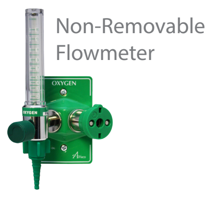
Dual Outlet with Flowmeter