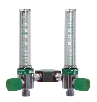
Dual/Y-block Flowmeter Assembly